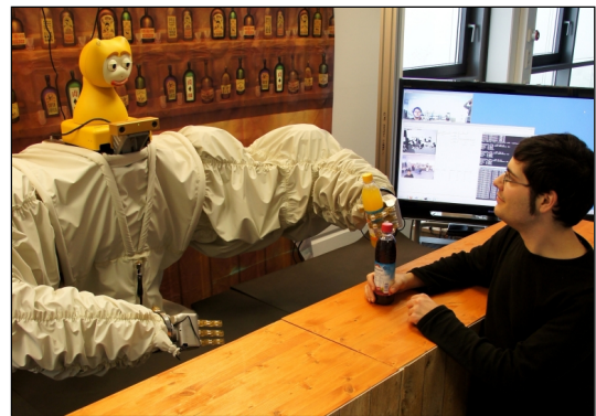
Figure 1: The JAMES robot bartender